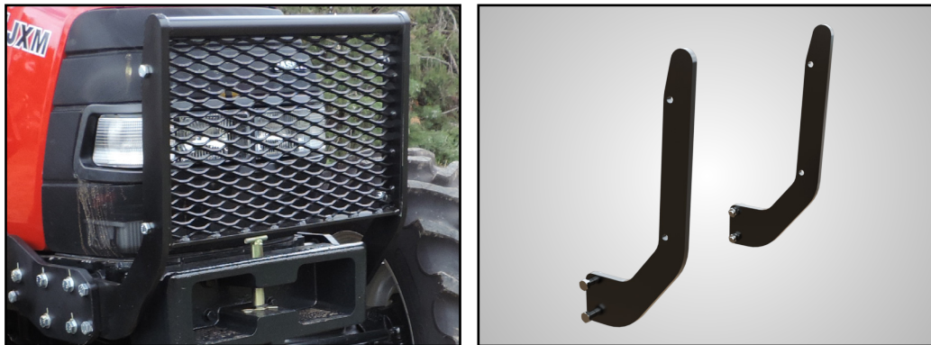
Guard Options: Protect the front of your investment with a grille guard or bump guard.