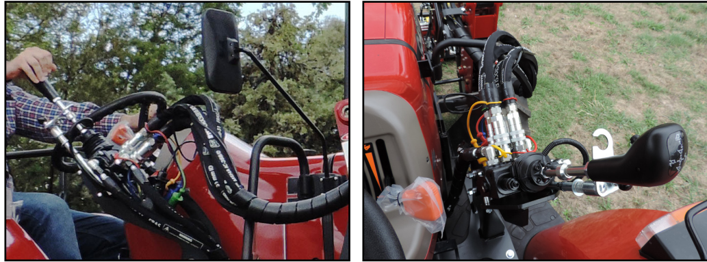
Auxiliary Valve Kit: Joystick control positioned to suit operator requirements.