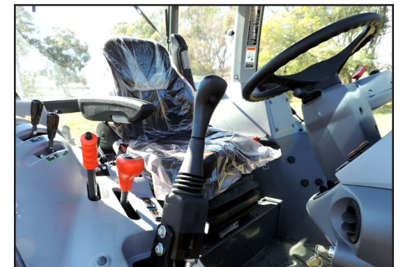
Auxiliary Valve Kit: Joystick control positioned to suit operator requirements.