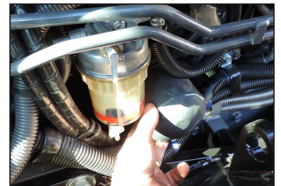
Service Access: Easy access to all the serviceable parts and components of your tractor, including air filters, oil filters and sump plug.