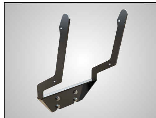
Guard Options: Protect the front of your investment with a grille guard or bump guard.