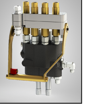
Auxiliary Valve Kit: Joystick control positioned to suit operator requirements. Loader connection is easy with a multi-coupler.