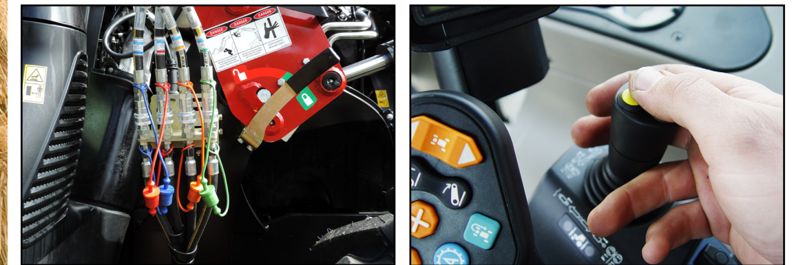
Midmount Remotes Kit: Integrated loader controls utilising host tractor joystick conveniently positioned in the existing control console.

Contact your local tractor dealer for model compatibility of all Challenge products and accessories.