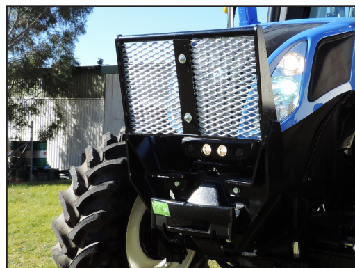
Guard Options: Protect the front of your investment.