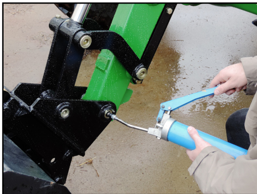
Service Access: Easy access to all the serviceable parts and components of your tractor, including air filters, oil filters and sump plug.