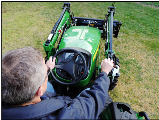
Auxiliary Valve Kit: Adjustable joystick control to suit individual operator requirements.