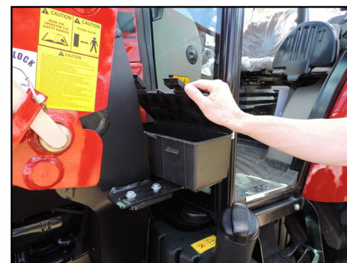
Toolbox Relocation: Convenient storage for tools.

Contact your local tractor dealer for model compatibility of all Challenge products and accessories.