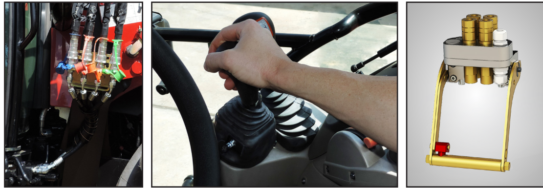
Midmount Remotes Kit: Integrated loader controls utilising host tractor joystick.