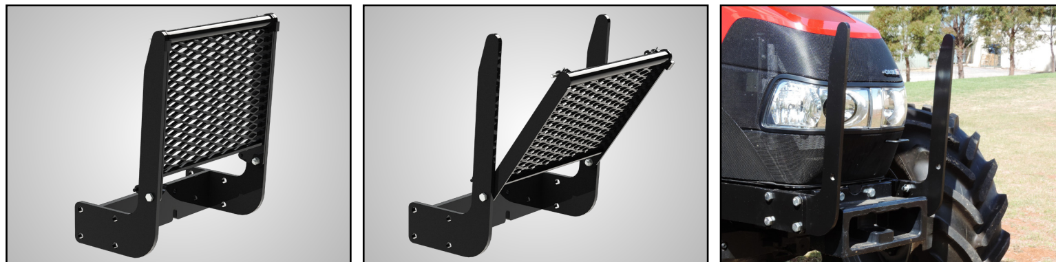
Guard Option: Protect the front of your investment with a grille guard or bump guard. The fold down grille guard, provides a more compact and functional design.

Bump/grille guards available with front weight carriage compatibility.