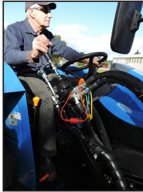
Auxiliary Valve Kit: Adjustable joystick control to suit individual operator requirements.