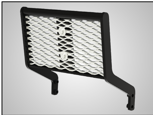
Guard Options: Protect the front of your investment with a grille guard or bump guard.