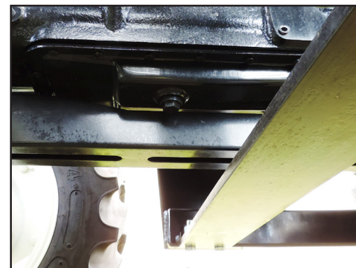
Service Access: Easy access to all the serviceable parts and components of your tractor, including air filters, oil filters and sump plug.