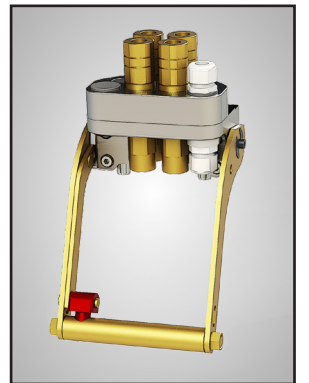
Midmount Remotes Kit: Integrated loader controls utilising host tractor joystick conveniently positioned in the existing control console.