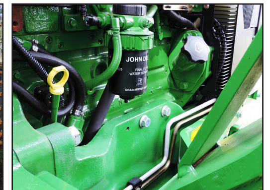
Service Access: Easy access to all the serviceable parts and components of your tractor, including air filters, oil filters and sump plug.