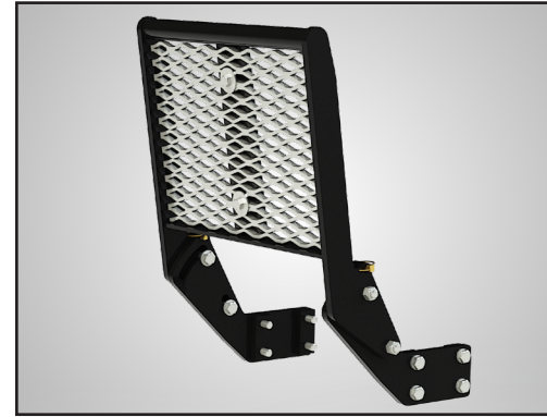
Guard Options: Protect the front of your investment with a grille guard or bump guard.