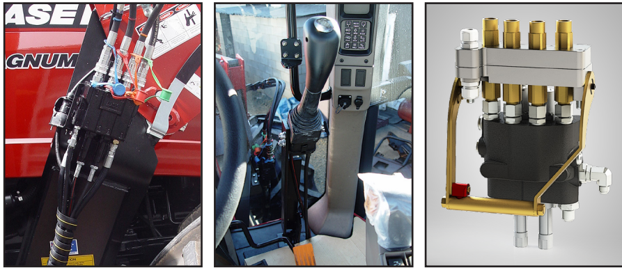
Auxiliary Valve Kit: Multi-position joystick control to suit individual operator requirements. Multi-coupler optional.

Contact your local tractor dealer for model compatibility of all Challenge products and accessories.