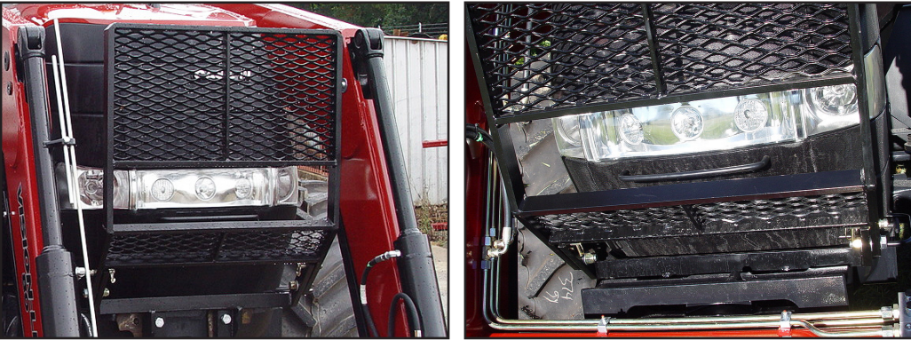
Guard Option: Protect the front of your investment. While still being able to make the most of your headlights.