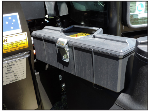
Toolbox Relocation: Convenient storage for tools.

Contact your local tractor dealer for model compatibility of all Challenge products and accessories.