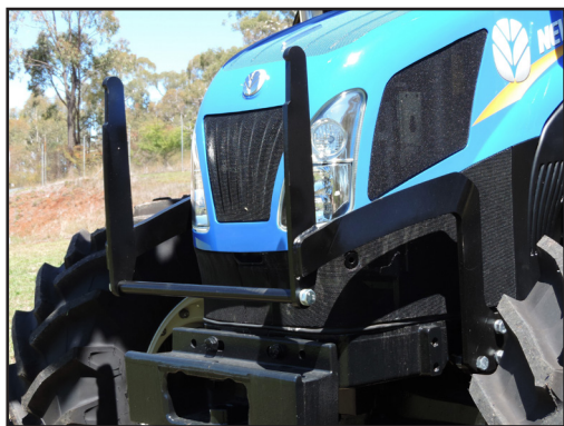
Guard Option: Protect the front of your investment with a grille guard or bump guard. The fold down grille guard, provides a more compact and functional design giving you access to all serviceable components of the tractor. The grille can be removed for night work.