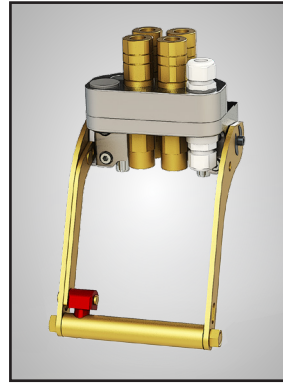
Midmount Remotes Kit: Integrated loader controls utilising host tractor joystick conveniently positioned in the existing control console.