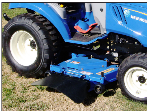
Tractor Equipment: Compatible with mower deck.