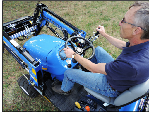
Auxiliary Valve Kit: Joystick control positioned to suit operator requirements.