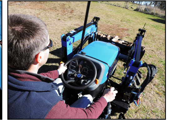
Auxiliary Valve Kit: Multi-position joystick control to suit individual operator requirements. Loader connection is easy with a multi-coupler.