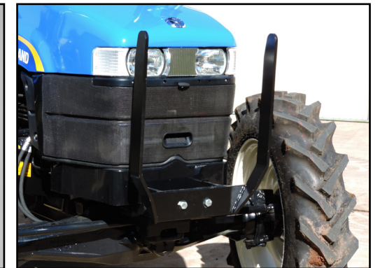
Guard Options: Protect the front of your investment with a grille guard or bump guard.