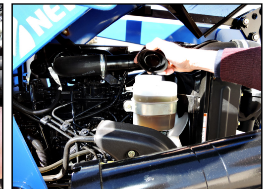
Service Access: Easy access to all the serviceable parts and components of your tractor, including air filters, oil filters and sump plug.