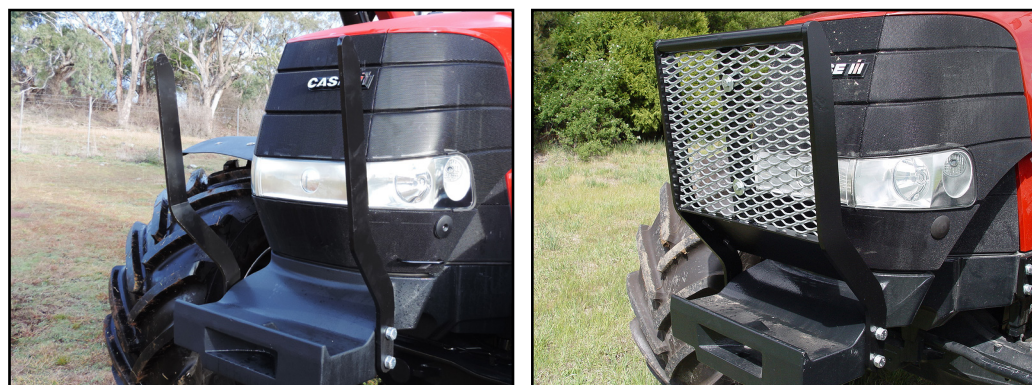
Guard Options: Protect the front of your investment with a grille guard or bump guard.