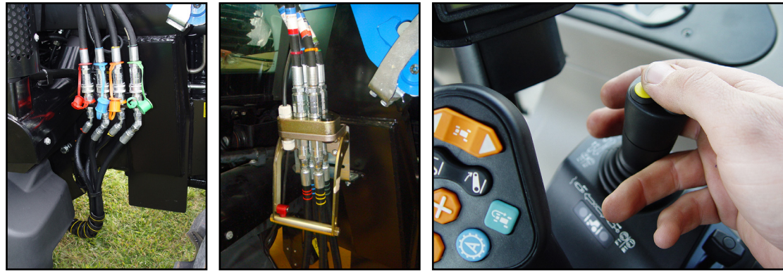
Midmount Remotes Kit: Integrated loader controls utilising host tractor joystick conveniently positioned in the existing control console.

Contact your local tractor dealer for model compatibility of all Challenge products and accessories.