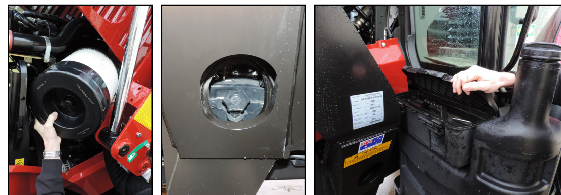
Service Access: Easy access to all the serviceable parts and components of your tractor, including air filters, oil filters and sump plug.