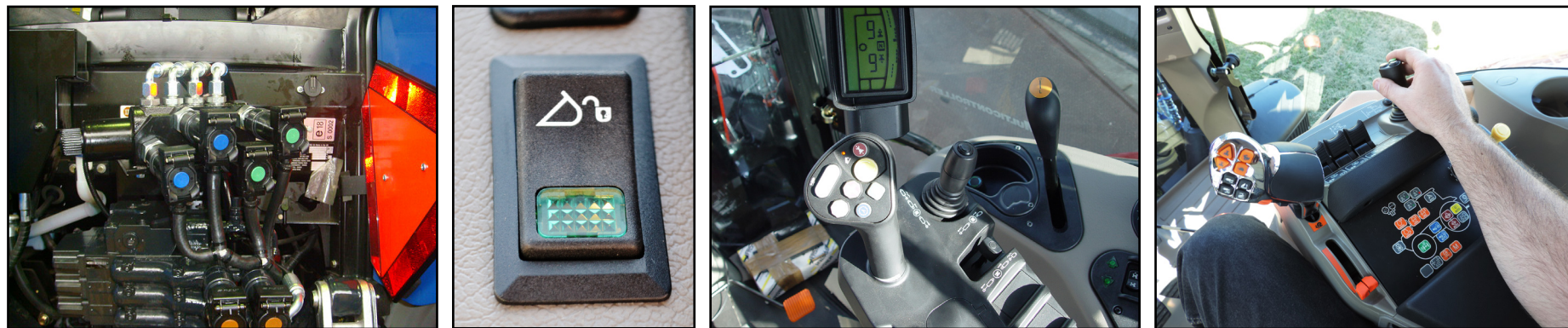
Electric Diverter Valve Kit: Switch between the rear control or the loader control from within the cabin, with a press of a button, increasing your productivity.