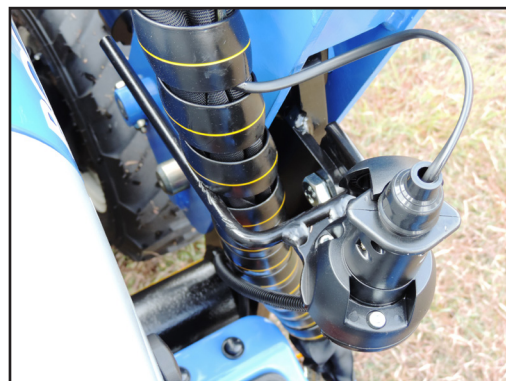
Midmount Remotes Kit: Integrated loader controls utilising host tractor joystick.