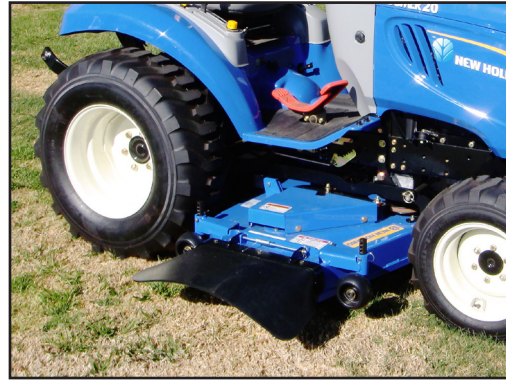
Tractor Equipment: Loader packages accommodate tractor manufacturers' mower deck or backhoe.