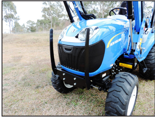
Guard Option: Protect the front of your investment.