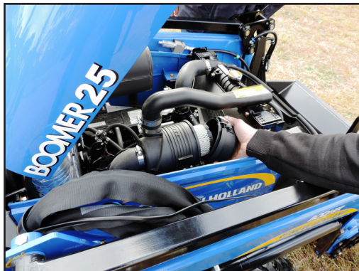
Service Access: Easy access to all the serviceable parts and components of your tractor, including air filters, oil filters and sump plug.

Contact your local tractor dealer for model compatibility of all Challenge products and accessories.