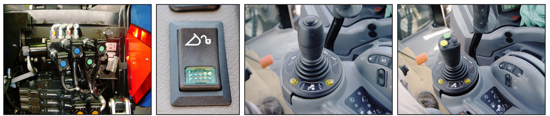
Electric Diverter Valve Kit: Switch between the rear control or the loader control from within the cabin, with a press of a button, increasing your productivity.