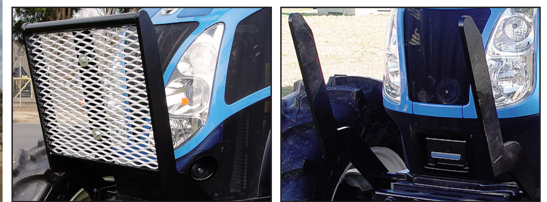
Guard Options: Protect the front of your investment with a grille guard or bump guard.